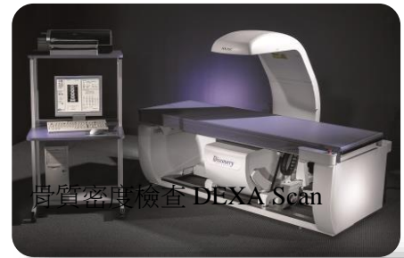
骨質密度檢查 DEXA Scan

(*適合患有脂肪肝，長期飲酒，有肝炎病史人士 Suitable for those with fatty liver, drinking habits and history of hepatitis)