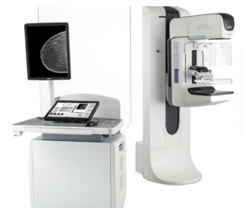
3D 乳房 X 光造影 3D Mammogram